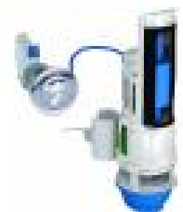
Fix the Flapper.

Don't flush your money, save it. Put food coloring in toilet tank, after 30 minutes if coloring in the bowl, time to replace flapper.